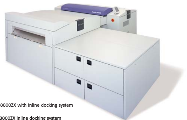
MA-L 8800ZX with inline docking system

Several autoloaders are available to enhance the productivity of the PlateRite 8800 Series, including the SA-L 8800II/8800ZX and the MA-L 8800II/8800ZX. With the addition of an autoloader and other appropriate equipment, you can create a system where everything from plate loading to imaging, plate transport, developing, and plate delivery is fully automated. The MA-L 8800II/8800ZX can be equipped with up to five plate cassettes that hold up to 500 plates total, enabling long periods of automated operation without any operator intervention.